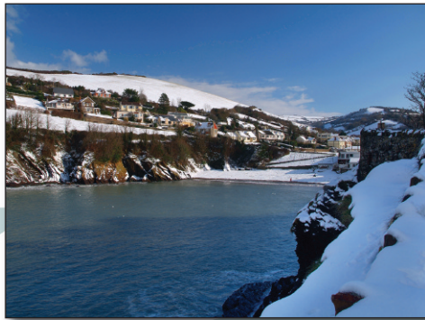
The beach and bay at Combe Martin.