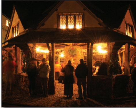
Spectators listen to musicians playing in the Yarnmarket at Dunster by Candlelight.