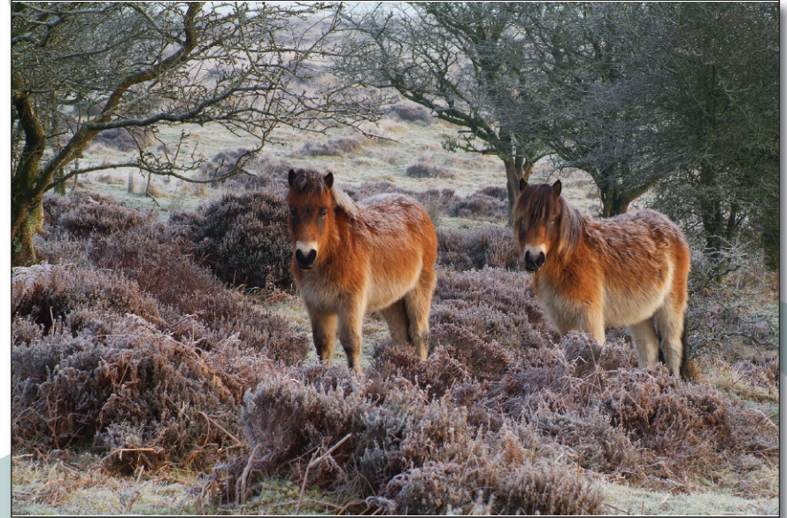
Exmoor ponies on Molland Common.