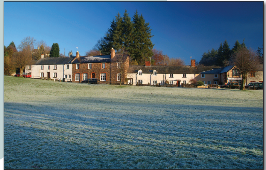
Frosty morning at Exford.